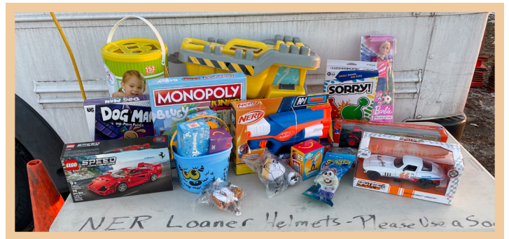
Toys for Tots Donation