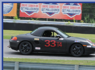
T4: Oliver Lucier