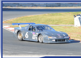
GT1: Douglas Valley