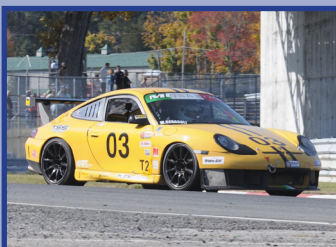
T2: Mauizio Cerasoli