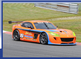
GT2: Bruce Beregeron