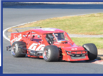
SPO: Ian Cook