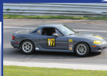
ITS: Abhi Ghatak