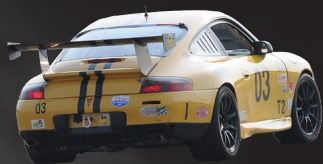
T2: Maurizio Cerasoli