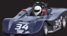
SRF3: Ethan Bentinck-Smith