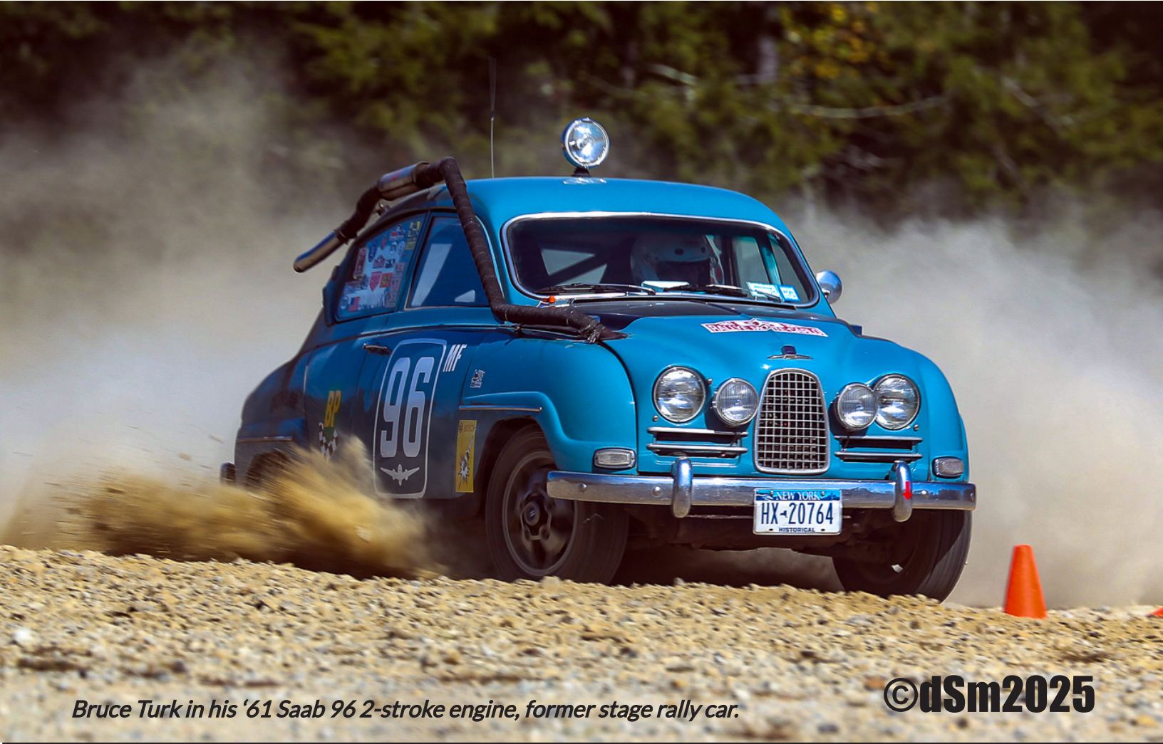
Bruce Turk in his '61 Saab 96 2-stroke engine, former stage rally car.