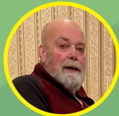
Dick Patullo Castle-Stone Steward Award

The NE Division Steward of the Year Award for his outstanding performance and contribution.